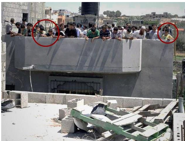
Rooftop human shields, including children 9